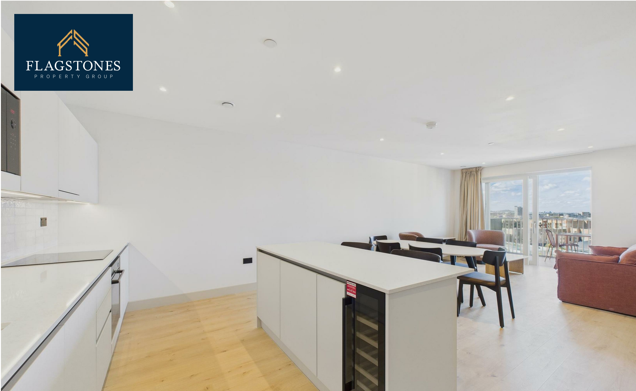
76454576 Duxford Tower, East Drive, Colindale, NW9 5QF £3,400